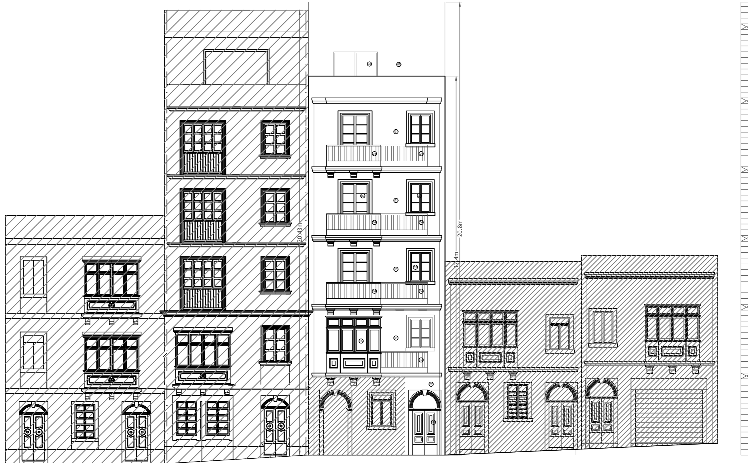
Proposed Streetscape Elevation Scale 1:100